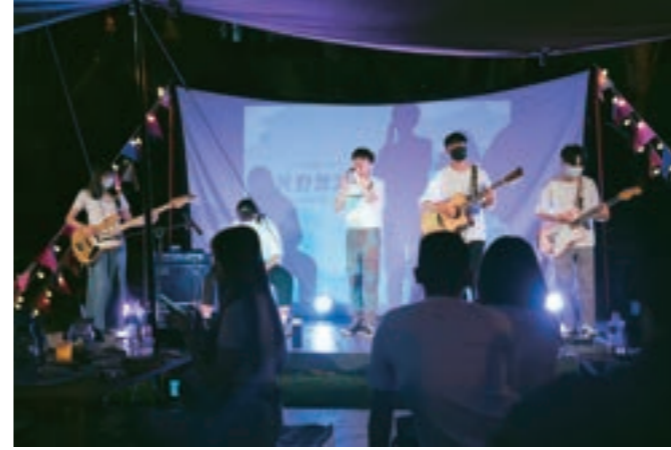
Diverse Student Clubs

With a wide range of majors and departments to choose from, Hungkuang University will help you discover your path and achieve your dream. Over the years, we have developed exciting and challenging programs, built a modern teaching environment with state-of-the-art equipment and facilities, and established relationships with many industry leaders. Our promise is "Graduation = Employment." By attending Hungkuang University, your dream will no longer be just a dream, it will become a reality.