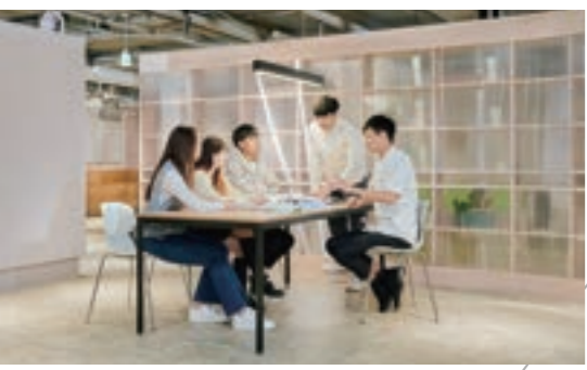
Comfortable Learning Space

At Hungkuang University, we believe that every student can reach their educational goals.