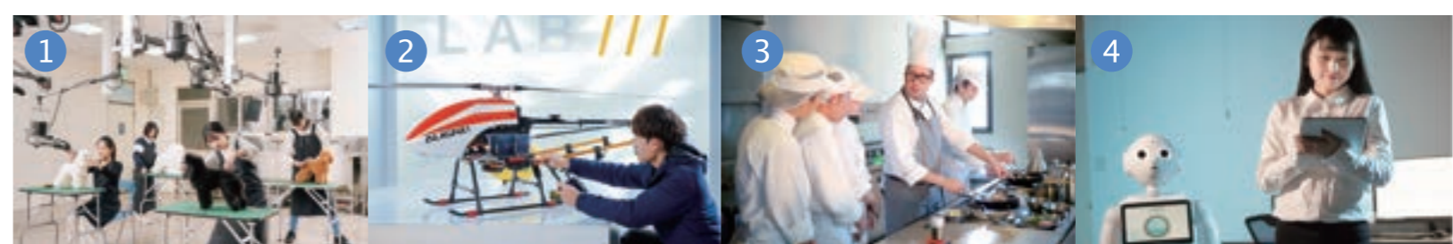
① Pet Grooming Classroom ② Drone Lab ③ Master-level Faculty ④ Integrated Artificial Intelligence for Cross-disciplinary Applications